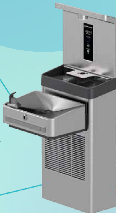
1211SFH model shown