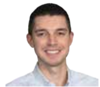
Tyler Hamilton Inside Support